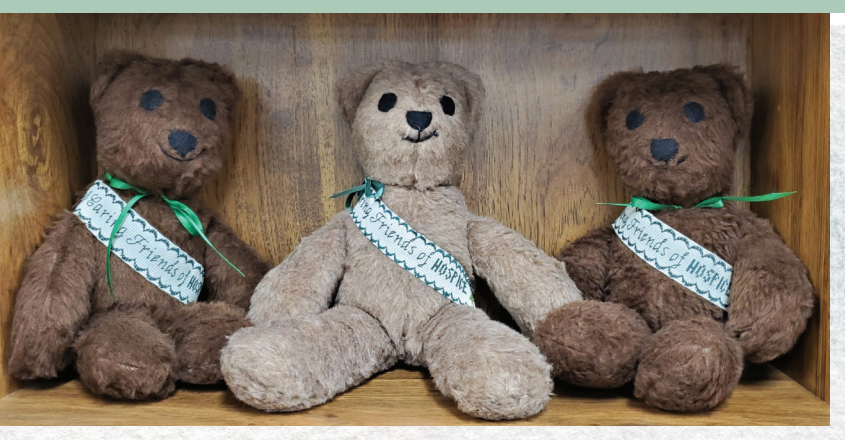
Friends of Hospice bear cubs lovingly await their new home.

For more information about FRIENDS OF HOSPICE please call 274-5121.