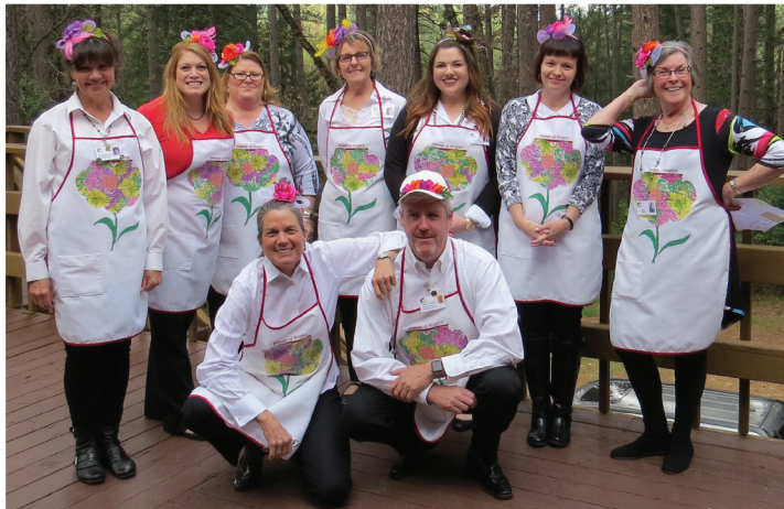
Members of Hospice of the Foothills' staff prepare to serve volunteers at the annual Volunteer Appreciation Tea.