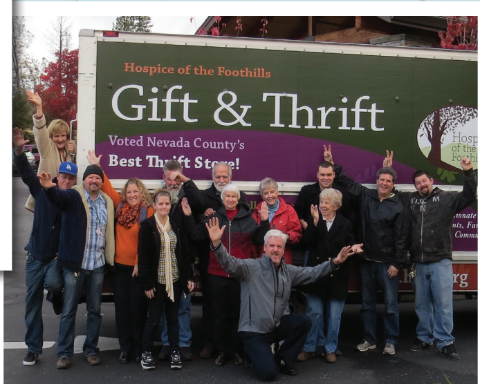
Hospice Gift & Thrift staff and volunteers have a little fun.