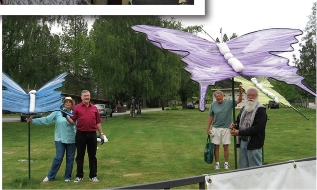
Friends of Hospice volunteers set up the Remembrance Garden for their annual Butterfly Garden event.